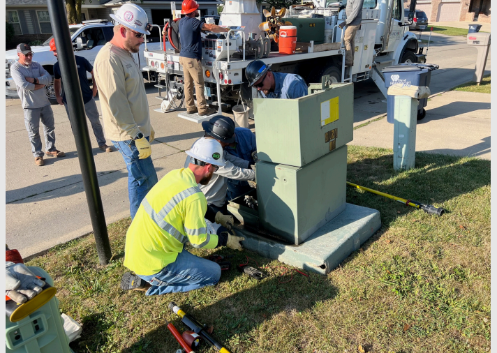
IMEA 613 apprentices assisted Frankfort Electric by changing out pad mount transformers.

IMEA Apprentice 613 Workshop was held this Monday, September 9 - Friday, September 13, 2024, in Frankfort, In. During the IMEA Apprentice 613 workshop participants received instruction on operation, troubleshooting, and metering of overhead and underground distribution systems. Upon their completion, participants will be able to demonstrate the knowledge and skill needed for the operation and troubleshooting of underground and overhead distribution systems. Energized conditions will be simulated during segments of the workshop held during the week.