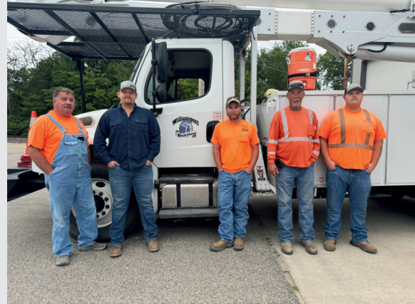
Williamsport Electric Utility